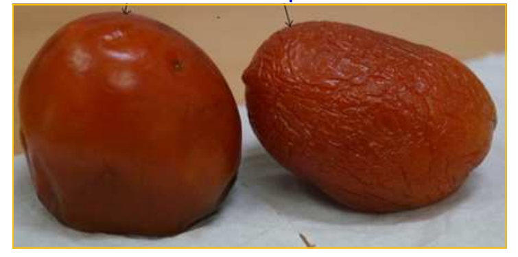
Washed Tomatoes after 40 days