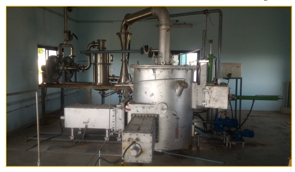
Plasma Pyrolysis / Gasification System installed at CSIR– CSMCRI

Bhavnagar. Joint study will be performed by FCIPT, IPR and CSIR-CSMCRI. Mixture of solvents/expired solvents will be disposed in high temperature environment produced by graphite based thermal plasma torch in the absence of oxygen. This will be a promising solution for laboratories and R&D institutes that handles huge amount of solvents in day to day activities.