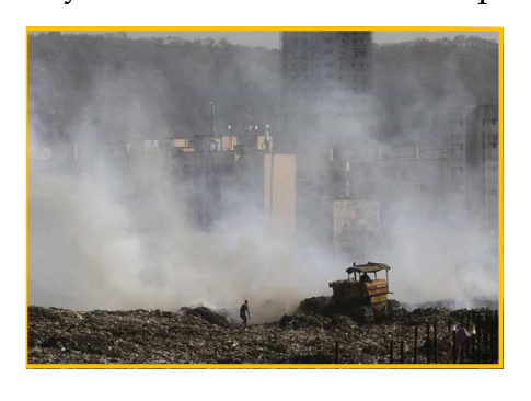
Deonar dump yard fire at Mumbai seriously affected air quality for 3 days

India is producing approximately 1.4 Lakh tons of Municipal Solid Waste (MSW) every day. MSW is finally dumped at open site at the outskirt of the city which has resulted in pil-